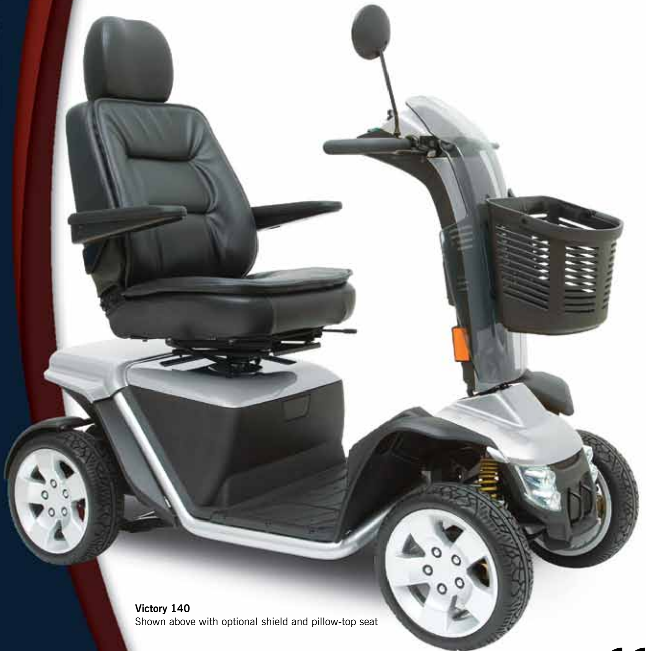
Victory 140 Shown above with optional shield and pillow-top seat

Bristling with high performance features like a full suspension, low-profile tyres and a hydraulic sealed brake system the Victory 140 is a powerful blend of power and precision. The Victory 140 features sleek aggressive style and a wealth of standard luxury touches like a wraparound delta tiller and LED lighting making it the ultimate outdoor scooter.