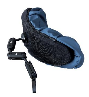
The arm of the headrest consists of replaceable strong ball joints.

The Power version has the motor built into the 12 \frac{1}{2} " wheels. The total width is therefore greater on the electric propulsion variant.