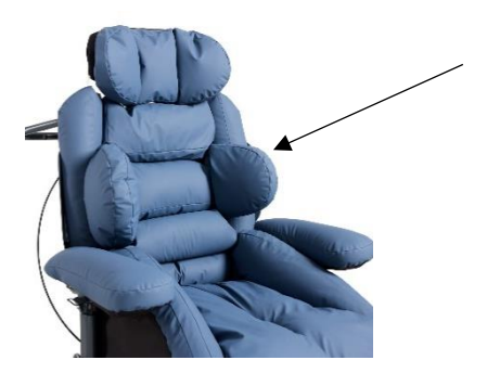
Angled padded body supports.

Joints for mounting of detachable swing-away legrests is also available.