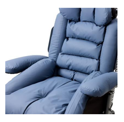
Padded skirt guards.

Asymmetrical adjusting makes it easier to address anatomical challenges.