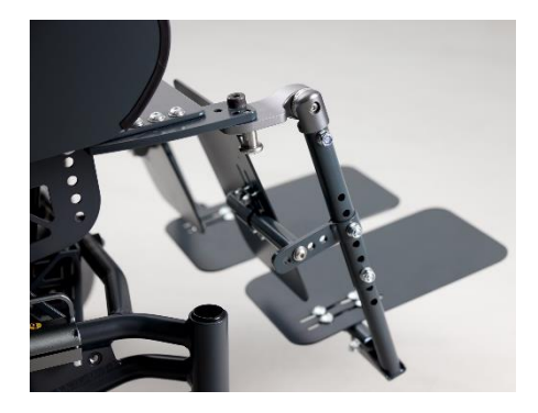
The legrests can be height-adjusted and angle-adjusted above the knee and ankle joints.