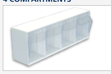
White sides and transparent fronts.