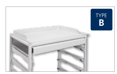
Grey plastic on melamine plate, 600 x 400 mm