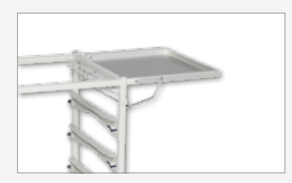
Available for 30 / 40 as well as 40/60 trolleys.

1166042 For 40 / 60 trolleys 1166041 For 30 / 40 trolleys