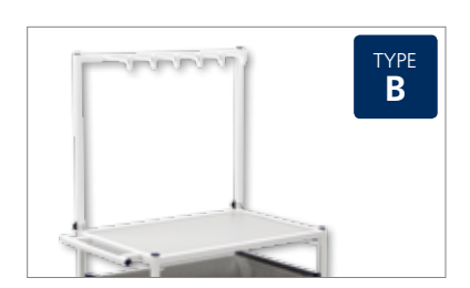
The hooks are ideal for infusion bottles / bags. Fitted in two clamps.