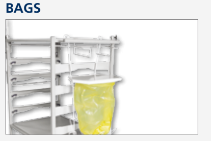
Made from bended coated wire. Lid and bags are sold seperately.

1164610 Holder * 1164608 Lid 1164611 Yellow bags