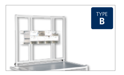
Holder made from aluminium.