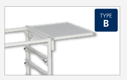
For 40 / 60 modular trolleys. Supports 400 x 300 mm trays and baskets.

1164606 Fixed stand 2234400 Optional laminate plate