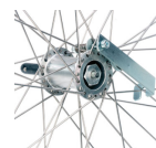
TETRA QR STD