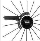
TETRA QR SPOX