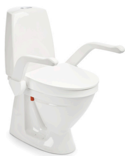
My-Loo with armrests 6 cm