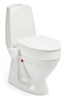
My-Loo 10 cm