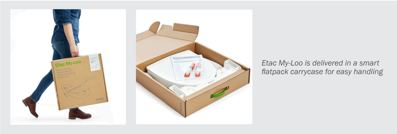
Etac My-Loo is delivered in a smart flatpack carrycase for easy handling