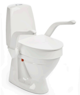
My-Loo with armrests 10 cm