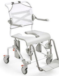
Etac Swift Mobil-2

Easy to adjust to different fixed seat heights, without using tools.