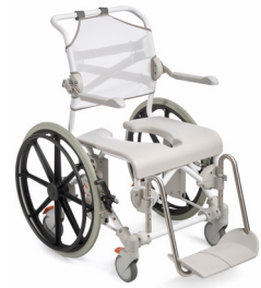
Etac Swift Mobil 24"-2