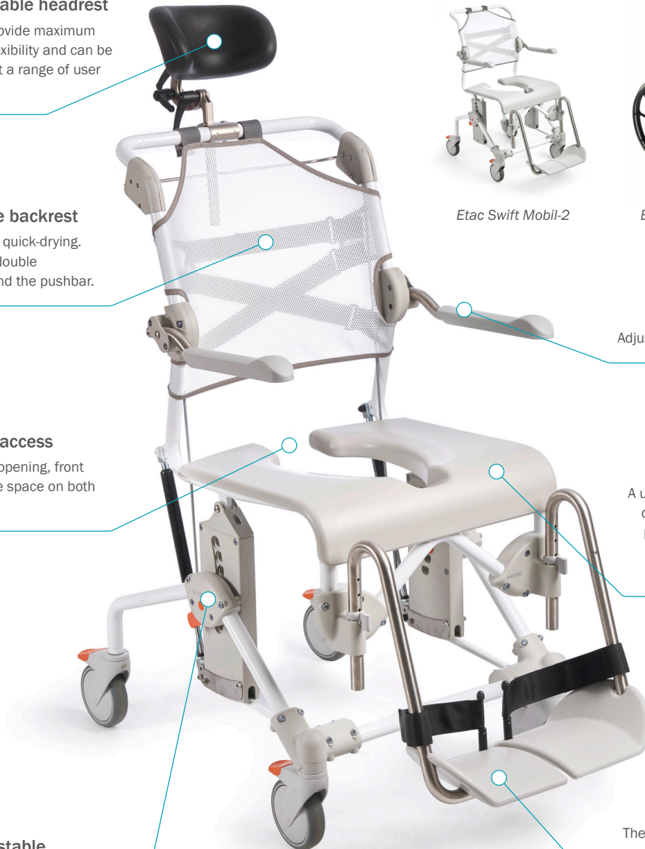
Etac Swift Mobil Tilt-2

The gently curved footplates provide instep and arch support, ensuring comfort, stability and relaxation.