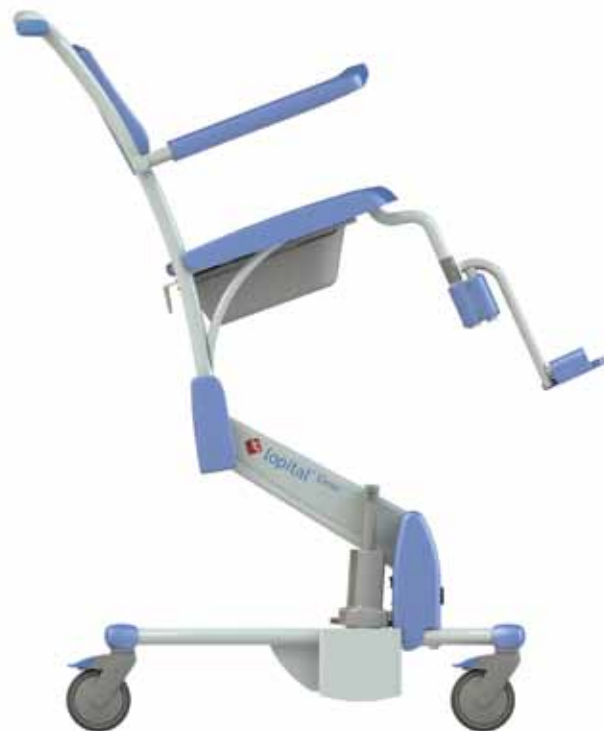
17 degree tilt adjustment.