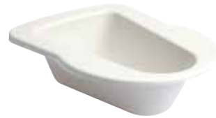
6950 1104 Plastic bedpan.