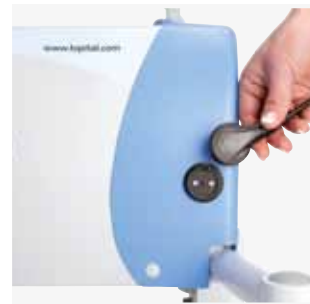
Charge point with magnetic coupling.