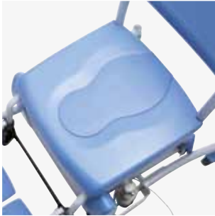
Ergonomically formed seat with inlay.