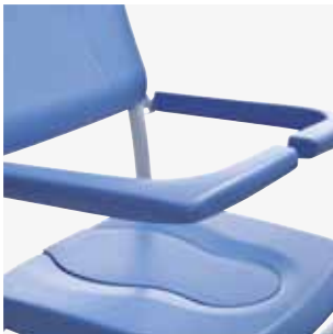
Independent, fold-up upholstered armrests with front lock.