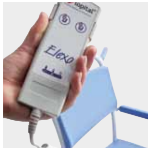
Handcontrol with battery indicator.