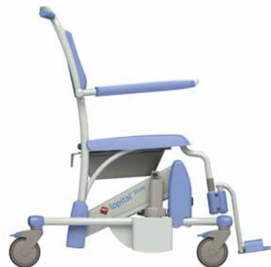
Lowest position 50 cm.