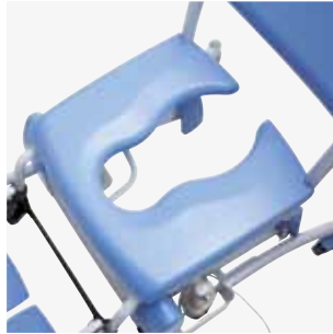
Ergonomically formed seat for toilet use.