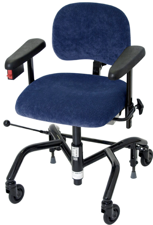
REAL 9100 PLUS EL