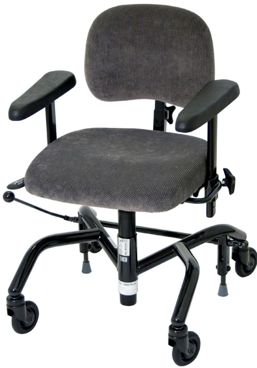
REAL 9000 PLUS