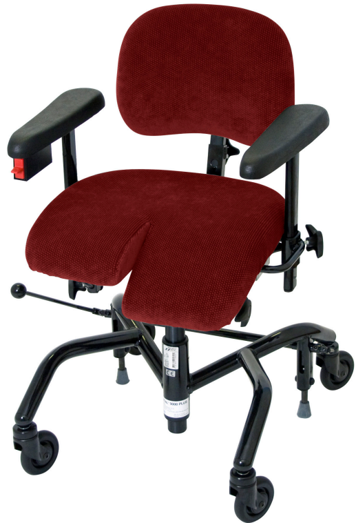
REAL 9800 PLUS COXIT EL