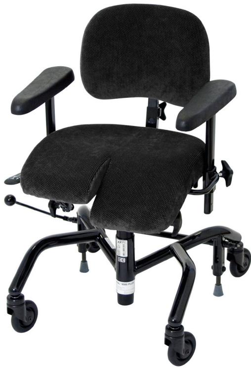
REAL 9700 PLUS COXIT